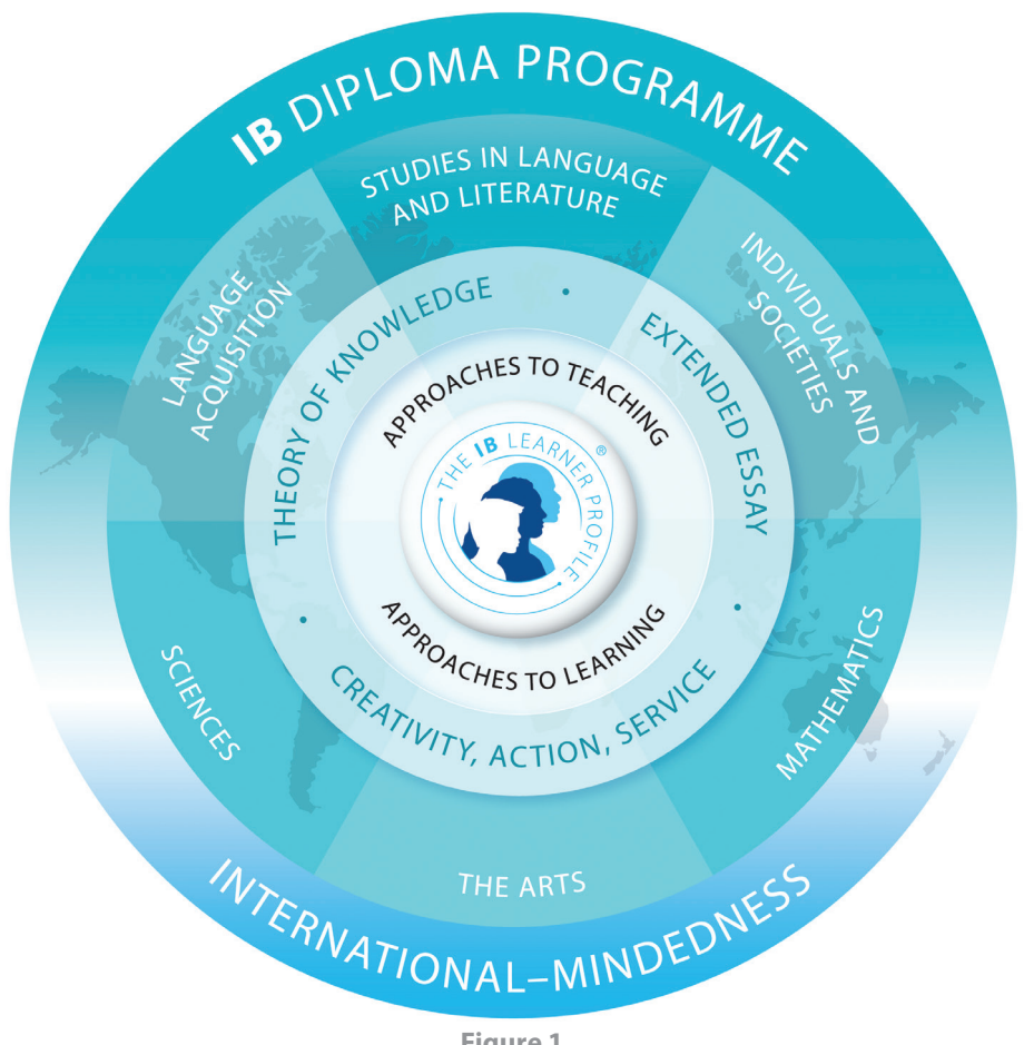
Figure 1 Diploma Programme model

The course is presented as six academic areas enclosing a central core (see figure 1). It encourages the concurrent study of a broad range of academic areas. Students study: two modern languages (or a modern language and a classical language); a humanities or social science subject; an experimental science; mathematics; one of the creative arts. It is this comprehensive range of subjects that makes the Diploma Programme a demanding course of study designed to prepare students effectively for university entrance. In each of the academic areas students have flexibility in making their choices, which means they can choose subjects that particularly interest them and that they may wish to study further at university.