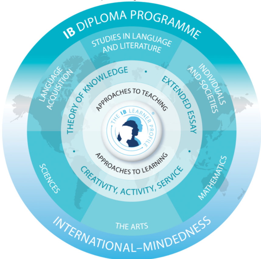
Figure 1 The Diploma Programme model

The course is presented as six academic areas enclosing a central core (see figure 1). It encourages the concurrent study of a broad range of academic areas. Students study two modern languages (or a modern language and a classical language), a humanities or social science subject, an experimental science, mathematics and one of the creative arts. It is this comprehensive range of subjects that makes the Diploma Programme a demanding course of study designed to prepare students effectively for university entrance. In each of the academic areas students have flexibility in making their choices, which means they can choose subjects that particularly interest them and that they may wish to study further at university.